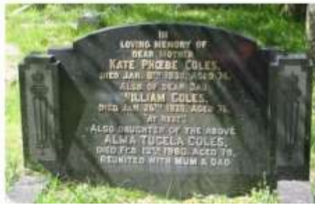
Grave 29 St Mary's, Bathwick Cemetery

Owned by Ancestry but information and photos have been created by volunteers. Both sites are free and are a great resource, especially when you find, as I have, the headstones of far flung ancestors.