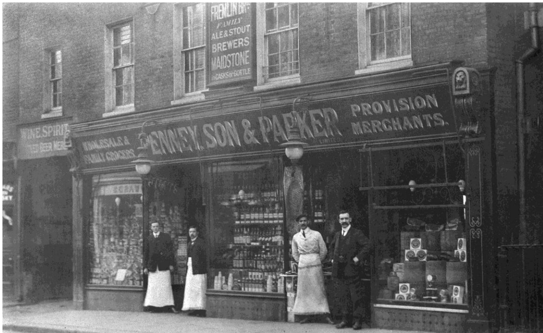
Penney, Son & Parker shop at 47 High St, date and people unknown